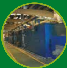
PU Coating Unit